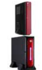
MHero-L-R enclosure (1x PCI, Slimline ODD) *new*