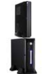
MHero-L-B enclosure (1x PCI, Slimline ODD)