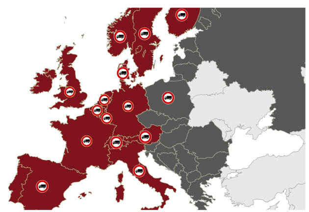
Countries with truck attributes

Detailed Network: The best road network with complete coverage ("City") Major Roads Network: Overland network with main roads (or better)